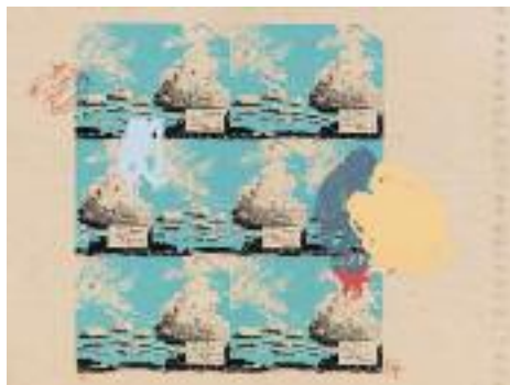
'Up and Over', 11 colour screenprint & spot varnish on birch plywood, Diana Taylor