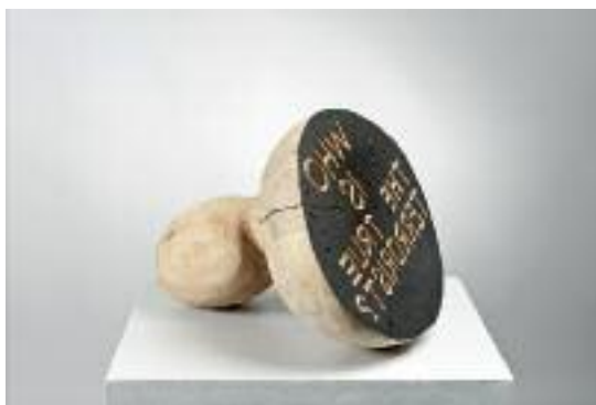
Who is the True Terrorist? Barthélémy Toguo