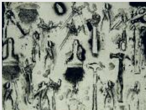
'Tools in the Earth', lithograph, Jim Dine

Adult £3.50, Children £1.50 Children under 4 Free Concessions and family passes available