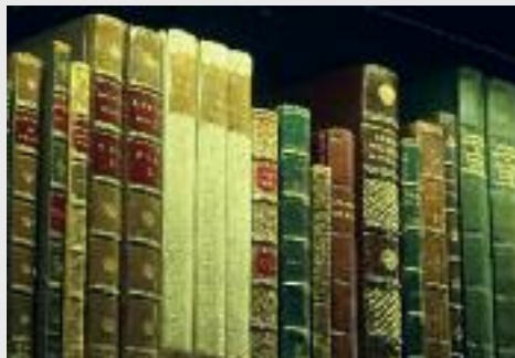
A view of part of the Bewick Collection at Central Library, Newcastle