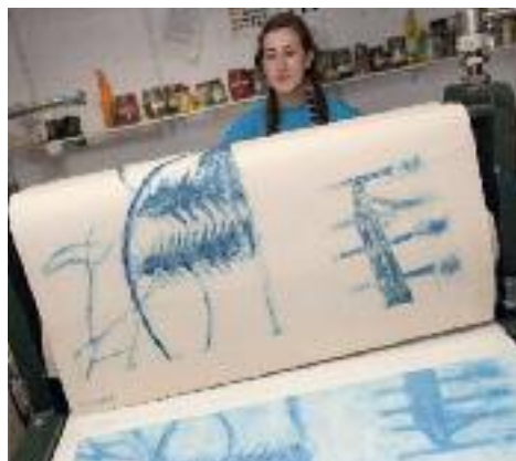
Preparing work for First Press exhibition