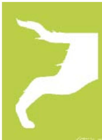
'Cut it out Pointed Sense', paper cut out, Noma Bar