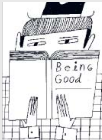
'Being Good', ink drawing, Nous Vous