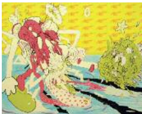
'Green in the Face', 7 colour lithograph, David Leigh

Adult £3.50, Children £1.50 Children under 4 Free Concessions and family passes available