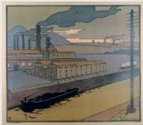
'The Factory', c.1930, colour lithograph, Roger Casse

Adult £9, Concessions £8 Children under 16 Free